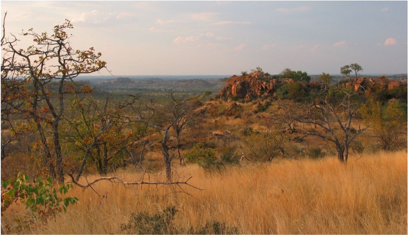
Figure 2 Park View

across the border in Botswana to the northwest and Zimbabwe to the northeast.