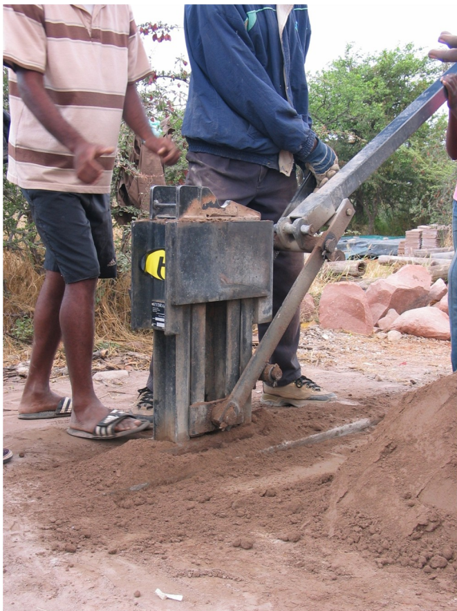
Figure 5 - Hand Press