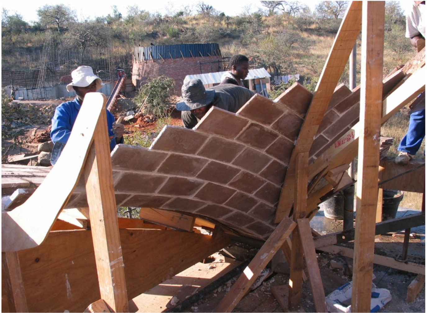
Figure 6 - Headquarters under construction

hoods and provides a skill base for future projects. We are actively pursuing projects in the region to make use of the skill base.