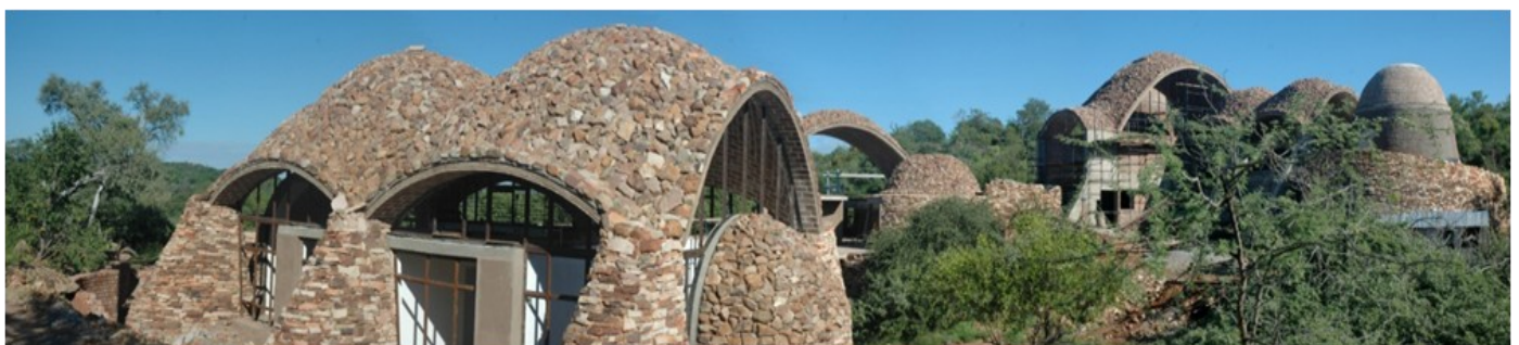
Figure 1 - Overall Panorama

Sited at the confluence of the Limpopo and Shashe Rivers in far northern South Africa, the Mapungubwe National Park celebrates the UNESCO World Heritage site in the context of a natural setting that re-establishes the indigenous fauna and flora of this region. [Figure 2 Park View] The park has been assembled from private land in the past few decades, and there are long-term plans to create an international peace park joining wild-lands