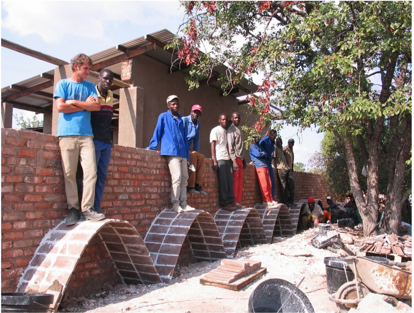
Figure 7 - workers test vaults

in the temperatures at Mapungubwe, really tested even basic trowel skills.