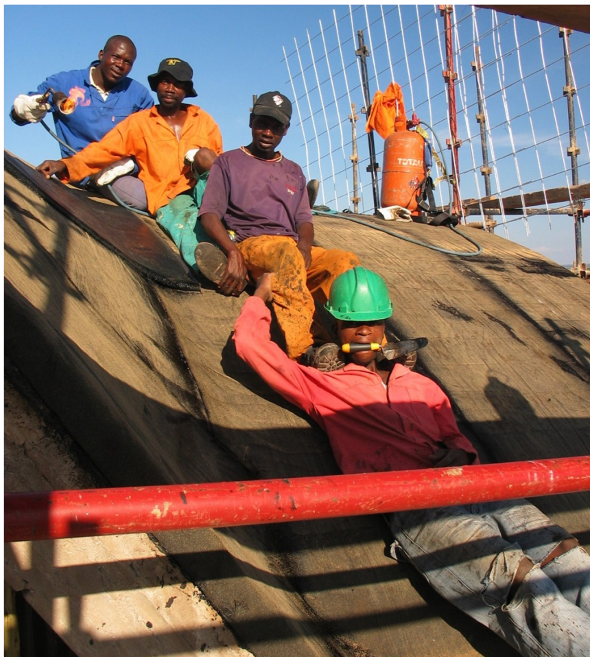
Figure 8 - Human Ladder

tion of the construction rates of each type of vault is included in Table 1. [TABLE 1 - Vault Costs] On an individual basis, however, the construction in South Africa used about 3 times as much labour per m 2 as at the Pines Calyx, but overall was a quarter of the cost. The hand-made tiles of the Pines Calyx were expensive at about £2.50 (30 Rand) each, while the tiles in South Africa cost about 2 Rand each. Compared to conventional tiles in the UK, the South African construction is about 1/3 the cost of the UK construction.