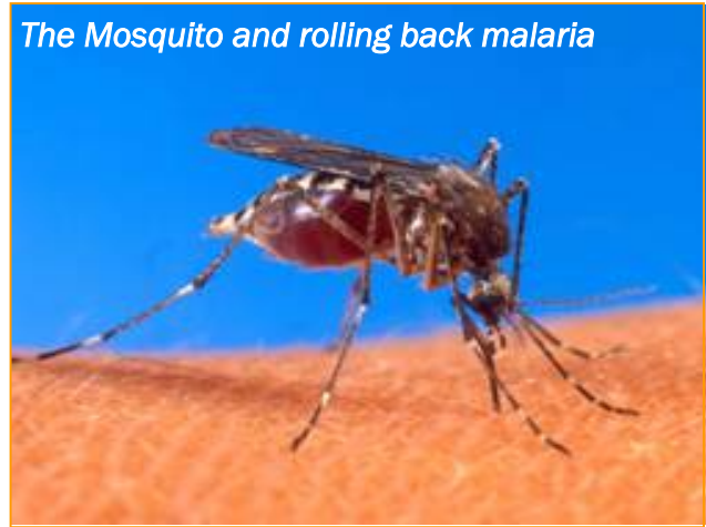
The Mosquito and rolling back malaria

refugees, or political detainees. In October 1943, Allied forces liberated Naples as they advanced northward through Italy. A typhus epidemic broke out shortly after the liberation, posing a significant threat to both troops and civilians.[1] The U.S. military mixed DDT with an inert powder and dusted it on troops and refugees, to great effect. Public health expert Fred Soper noted that "a thorough application of 10 percent DDT louse powder to the patient, his clothing and bedding and to the members of his household will greatly reduce the spread of typhus in the community." [2]